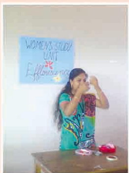
Training on flower making