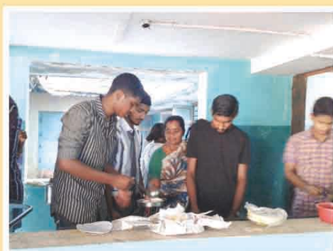
Distribution of food packets in Government Hospital Chengannur by the English Association.