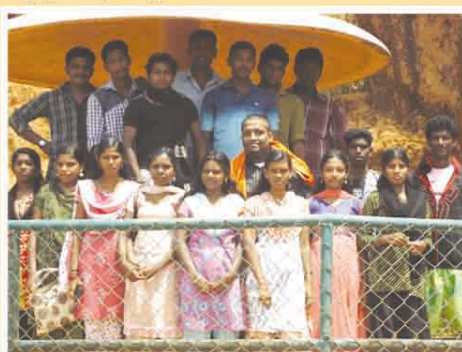
Sixth Semester History Students on a Study Tour.