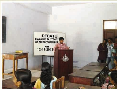
A debate on "Hazards and Potential uses of Nanomaterials" was organised by the Chemistry Association on 12/11/2013.