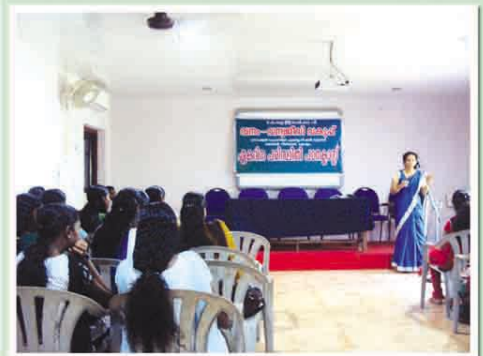
Nature Education Camp in association with Kerala Forest Department.