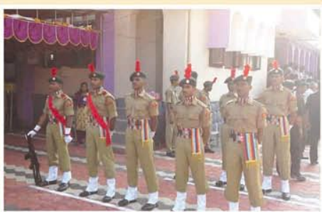
NCC cadets giving Guard of Honour to Honorable Chief Minister Sri. Oommen Chandy on Jubilee Inauguration Day.