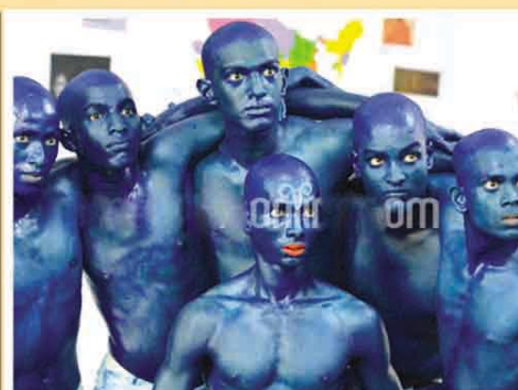
The MIME team of Christian College grabbed first prize in University Youth Festival.