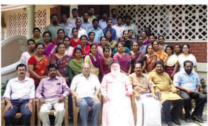
Members participated in the Two day conference organised by the Mar Thoma Higher Education Commission at Shanthigiri Ashram on 22/02/2014.