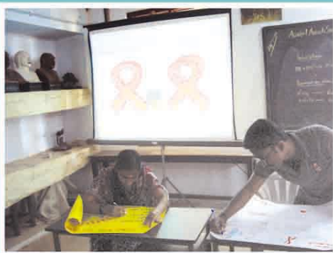
Poster Making competition.