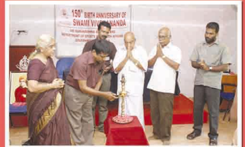
Swami Vivekananda's 150th birth anniversary celebration.