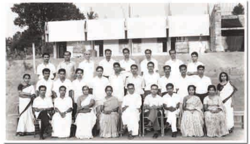
Members of the faculty of Christian College, Chengannur in the 1960's. The College building in construction is visible in the backdrop.