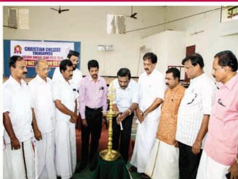
Alumni get together on 02/10/2013.