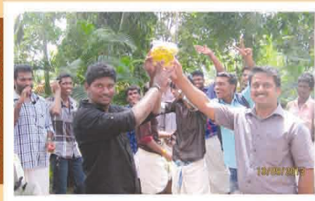
Prize distribution to winners.