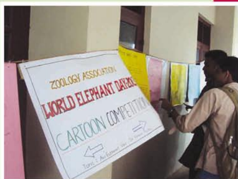
Cartoon competition organised by Zoology Association as part of World Elephant Day on 12/08/2013.