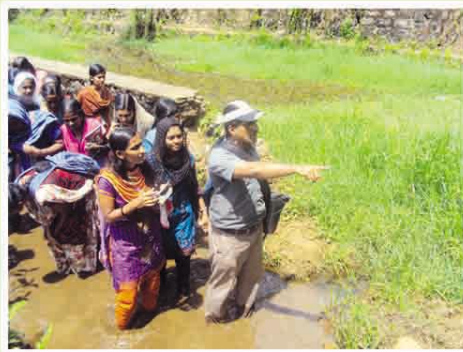
Survey of Dragon flies and Damsel flies of Aranmula wetland ecosystem.