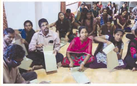
Training class on paperbag making.