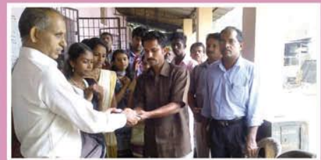
Visit and sponsoring of Onam feast by the staff and students of the Department of Economics to 'Snehadhara', home for the destitute.