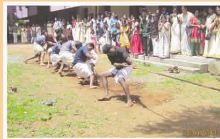
Tug of War.