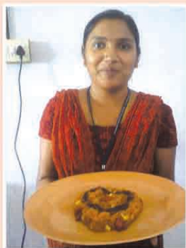
Cooking Class for Students