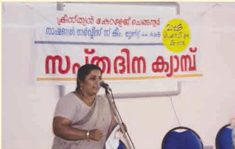
Inauguration of Annual Camp.