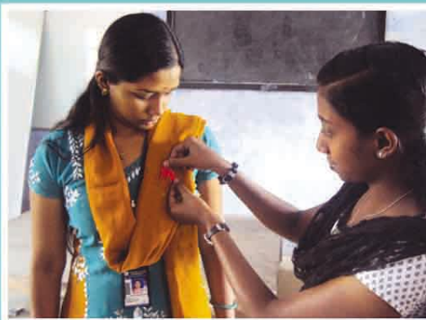
Observing the World AIDS Day 2013..