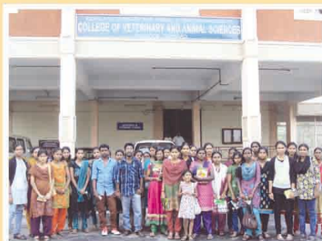
Lab visit organised by Zoology Association to College of Veterinary and Animal Sciences, Pookode.