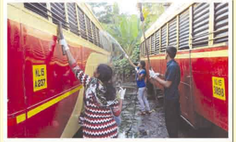
Cleaning of KSRTC buses of Chengannur depot by NSS Volunteers.