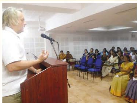
Canadian Author Drew Hayden Taylor speaking on "Humour Texts and Contexts" in the Invited Talk organised by Department of English on 04/12/2013.