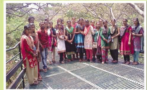
Visit to Thenmala Eco Tourism Centre.