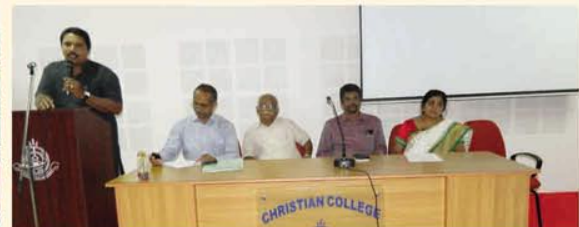
Economics Alumni Family Meet held on 27 th December, 2013 at the Rev. A.A. Pylee Memorial Seminar Hall.