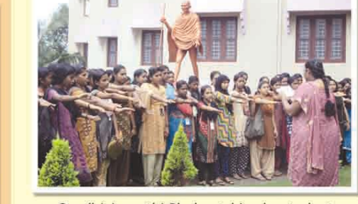
Gandhi Jayanthi Pledge taking by students.