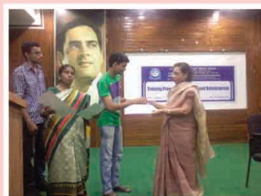
NSS volunteers who attended the National Training programme on youth and Volunteerism organized by the International Centre for Excellence in Youth Development at RGNIID, Sriperumbudur from 28-30 August, 2013.