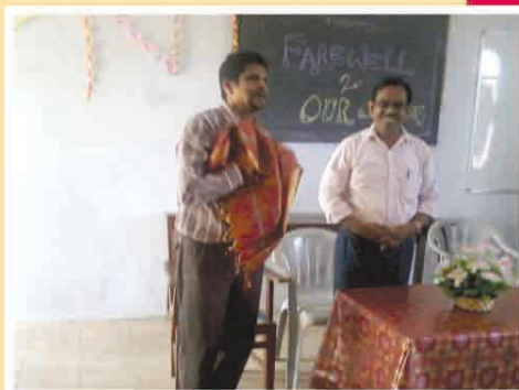
Farewell to the retiring principal and outgoing DC III students organized by the Mathematics association on 20/03/2014.