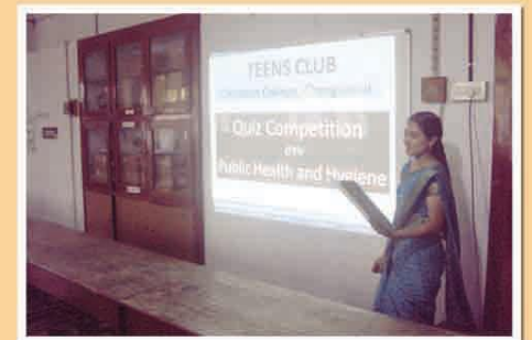
Quiz competition organised by Teenz Club.