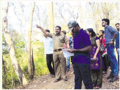
Nature Camp at Thenmala.