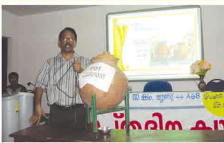
Training session on Waste Management