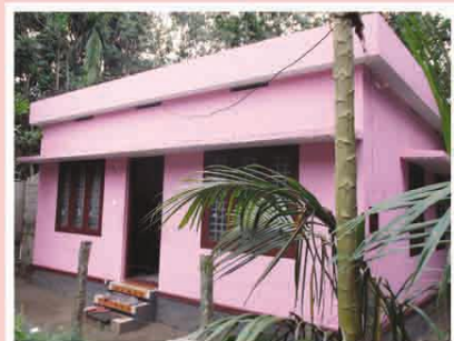
House constructed as part of the Golden Jubilee programme.