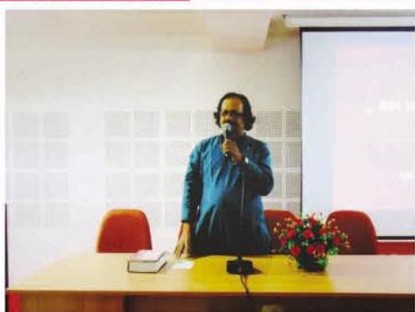
Prof. Madhu Iravankara, noted film critic, engaging classes on script writing in the one day seminar organized by the Department of Malayalam on 29/08/2013.