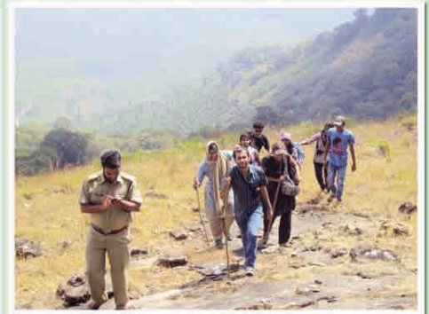
Nature Camp at Nelliampathy Wildlife Sanctuary.