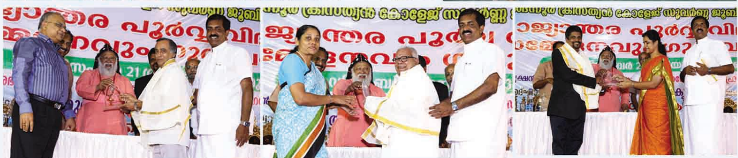
Guruvandanam organized by the Alumni Association to honour the retired staff.