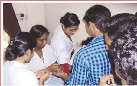
Blood Group Identification programme.