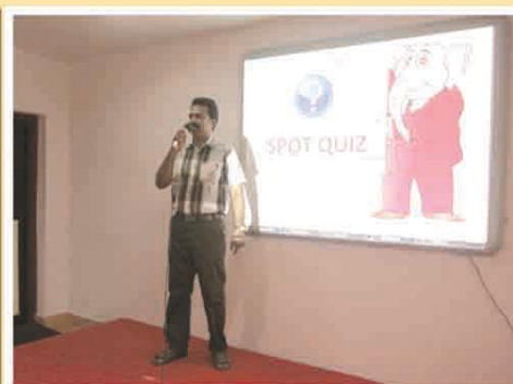
Spot Quiz competition Organised by Zoology Association on the topic Elephants as part of World Elephant Day 2013.