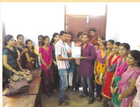
Release of a Manuscript magazine 'Focus to the Secrets of Science' published by Chemistry Association on 26/03/2014.