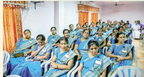
Staff meeting to discuss details of the Proclamation rally.