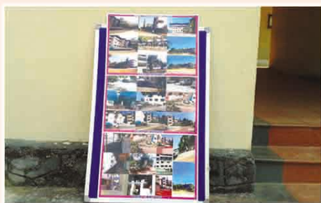
Exhibition of photos taken by club members entitled- "Capture the Campus".