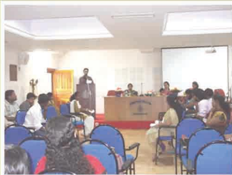
A debate competition was arranged for college students on 09/10/2013 on the topic 'Is believers of religion are against the ideas of genetic engineering'. organised by the Department of Botany.