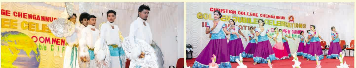
Cultural Programmes performed by students.