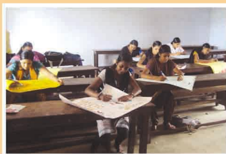
Poster Making Competition.