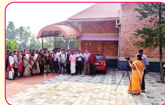
Educom Raffles Higher Education conducts