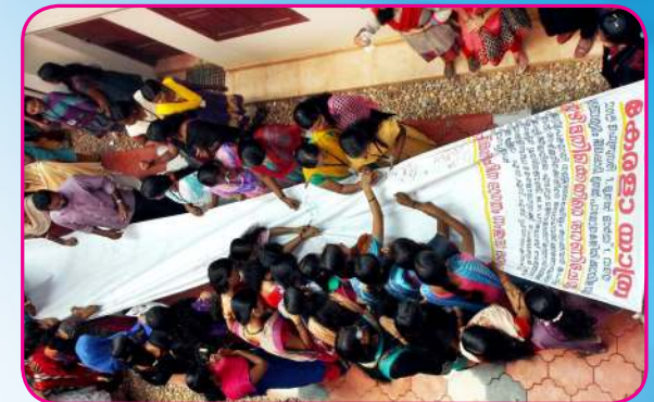
Poster exhibition as part of National Anti corruption Day