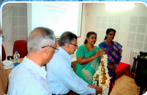
Inauguration of ADMAC 2015 Department of Chemistry