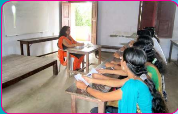
Recruitment Drive of Catholic Syrian Bank