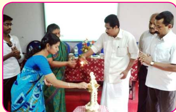
Science Club Students – Experiencing The Reality