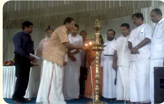
Inauguration of B.Com. & Research Centre In Physics