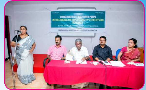
Seminar on Interlinking of rivers and its effect on ecology