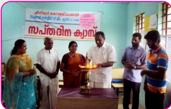
NSS Annual 7 Day camp