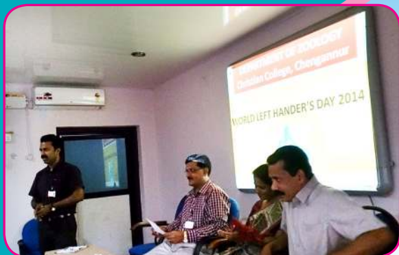
World Left Handers Day celebration 2014 by Zoology Association