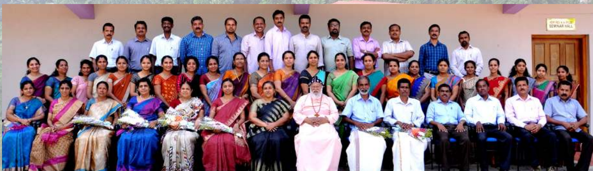
NON - TEACHING STAFF WITH MANAGER