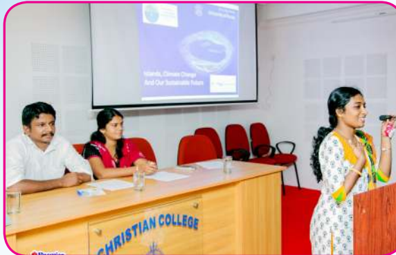
World Environment Day 2014- Talk on Small Islands and Climate Change.