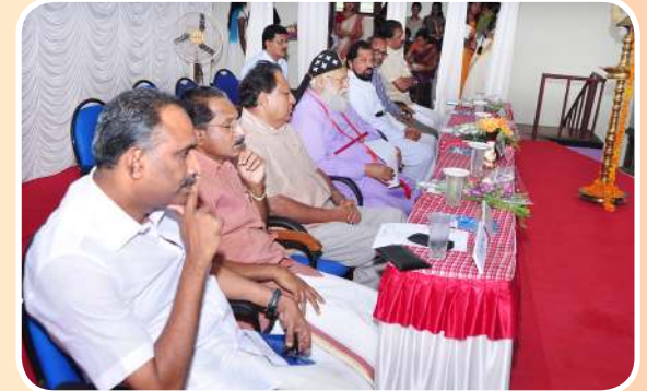
Inauguration of M. Sc. Zoology