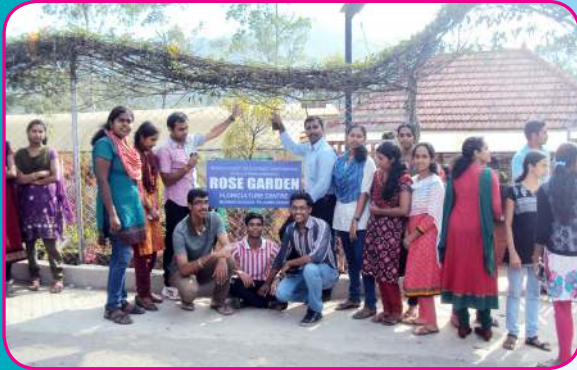
Nature camp at Pampadumchola National Park