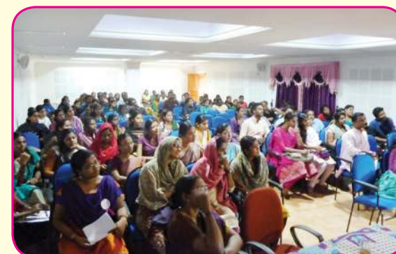
Educom Raffles Higher Education conducts