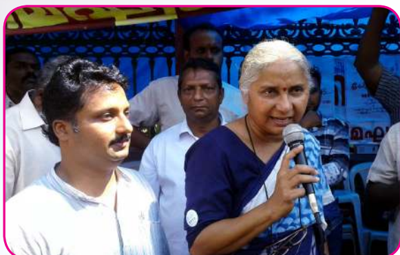
Bio diversity 3