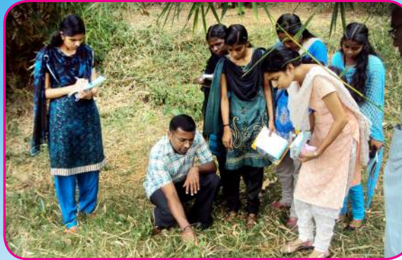
Spider survey on the banks of River Pampa