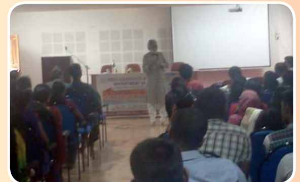
Talk on – Department of physics