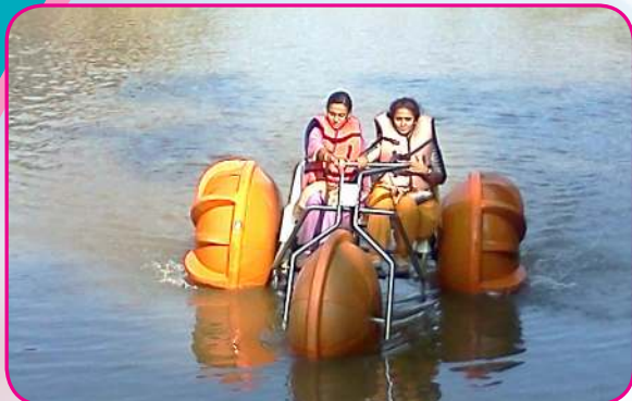
Staff Tour 2