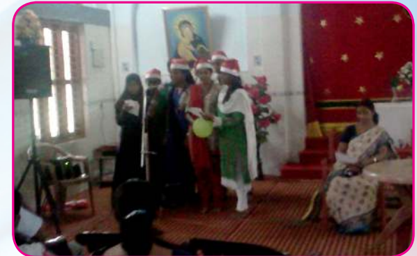
Christmas Celebrations With Cancer Patients- Shanthigiri Asram