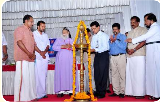
Inauguration of M. Sc. Zoology