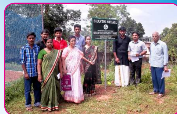
Bio diversity 2