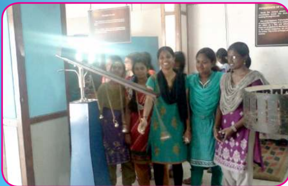
Science Club Students – Experiencing The Reality