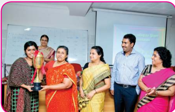
Inter-Collegiate Paper Presentation and quiz Competition organised by Dept. of Economics