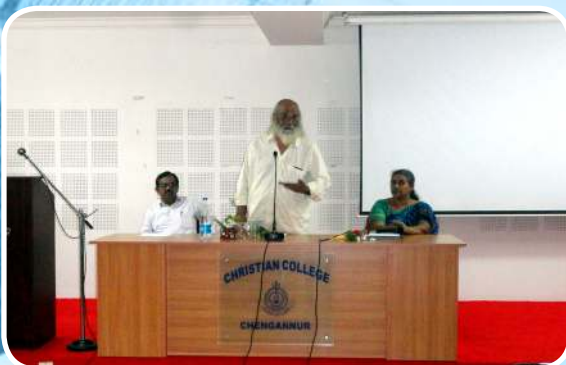
Department of Mathematics