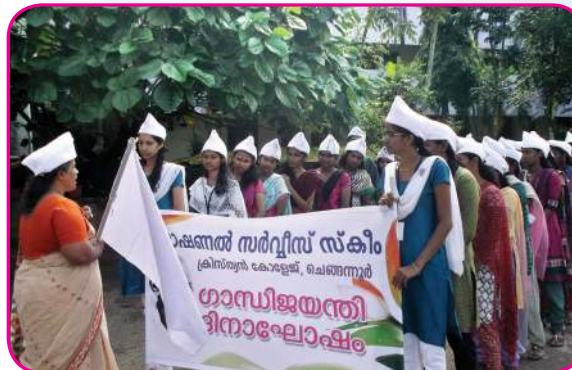
NSS Annual 7 Day camp