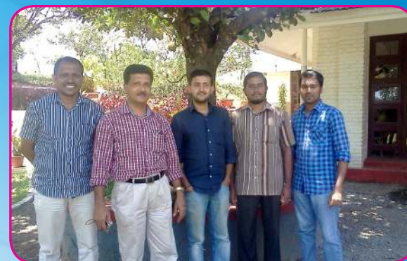
Staff Tour 1