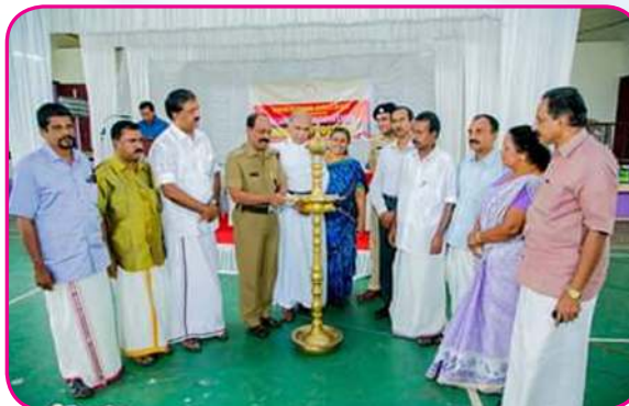
Alumini Association Inauguration