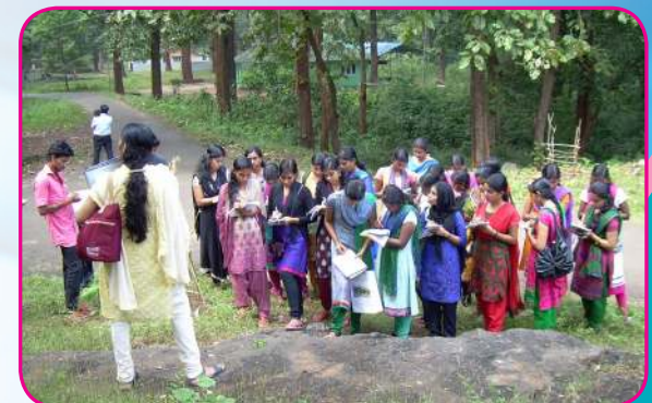
Final year Botany Study Tour 2014