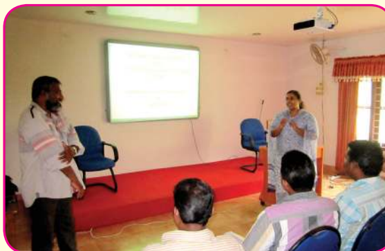
Educom Raffles Higher Education conducts