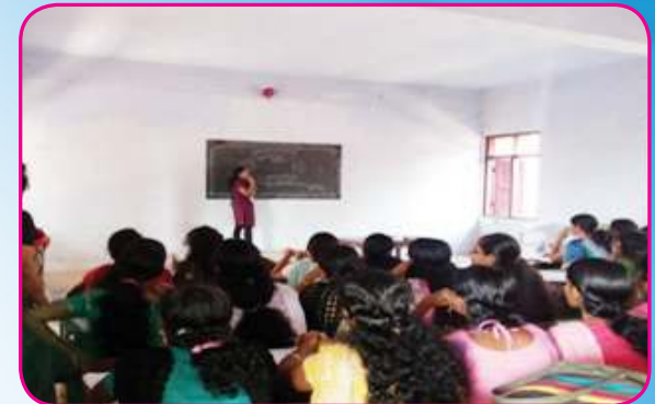
Peer Teaching DC II Economics