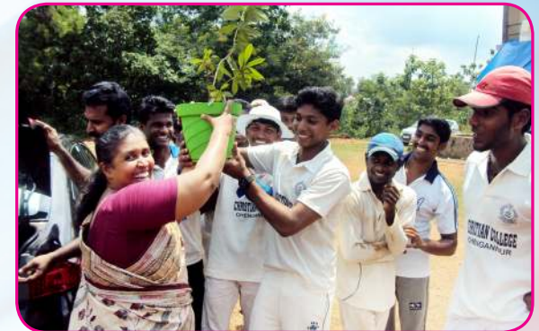
World Environment Day 2014- Green Cricket : Prize distribution to the Winners