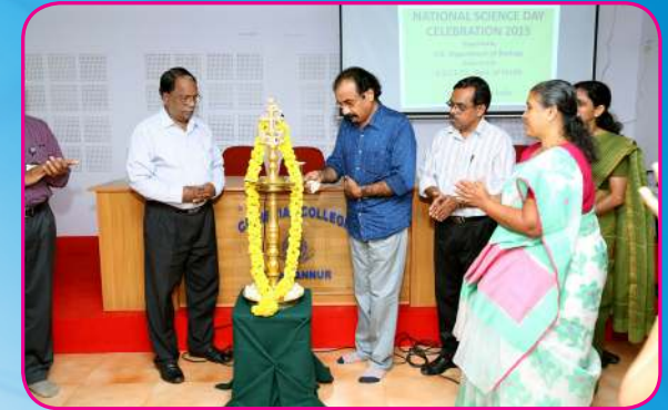
Inauguration of National Science Day celebration 2015