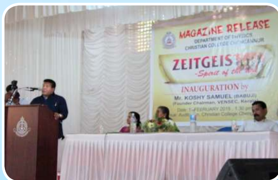
Department of Physics