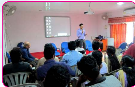
Educom Raffles Higher Education conducts an Orientation Programme on Career Prospects