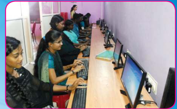
Add on Course in Computers conducted by Dept. of Economics