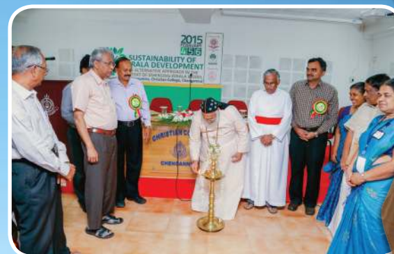
UGC & NABARD Sponsored National Seminar Feb 4-6 Department of Economics