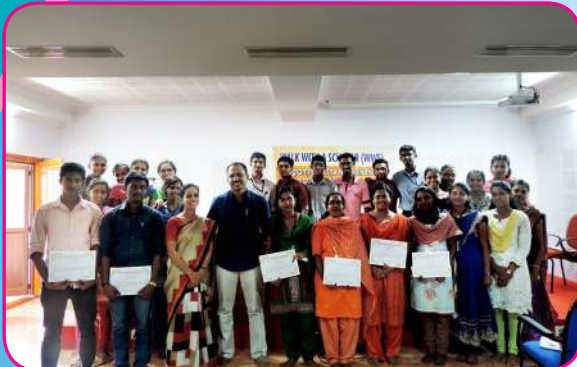
WWS Co-ordinator, Mentors and Mentees with the winners of the Inter-Departmental Debate Competition on the topic 'Need for Politics in Campuses'