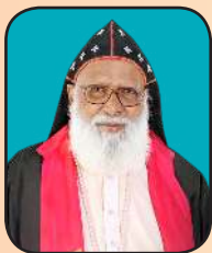
The Most Rev. Dr. Philipose Mar Chrysostom Mar Thoma Valiya Metropolitan