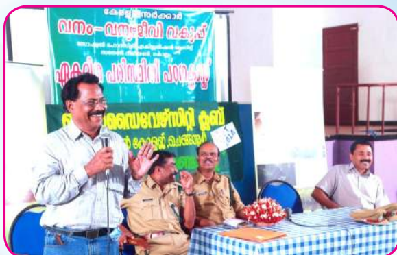
Bio diversity 1