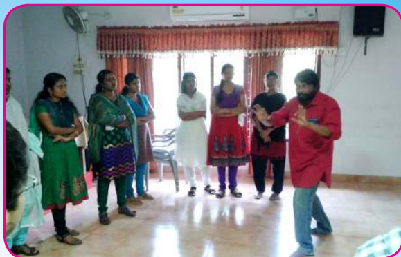
Best Arts 2