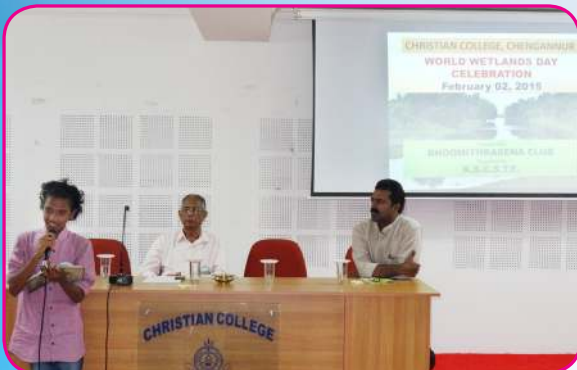
World Wetlands Day 2015 - Inaugural address by Master Minnon