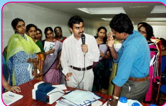
Workshop for Higher secondary teachers organized by Zoology Department