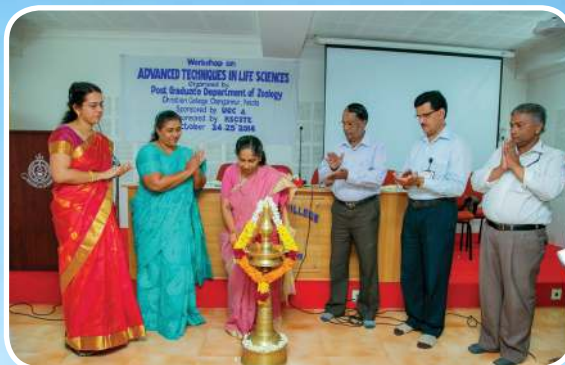
UGC sponsored Workshop on Advanced Techniques in Life Sciences Department of Zoology