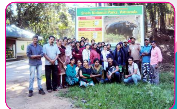
Nature camp at Pampadumchola National Park