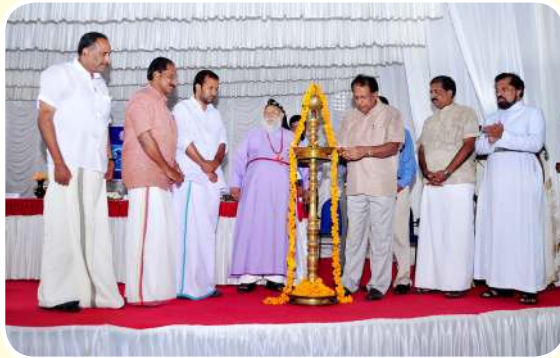
Inauguration of M. Sc. Zoology