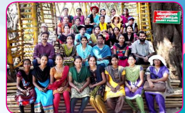
NSS Annual 7 Day camp