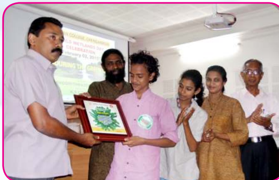
World Wetlands Day 2015- Honouring the Green Hero