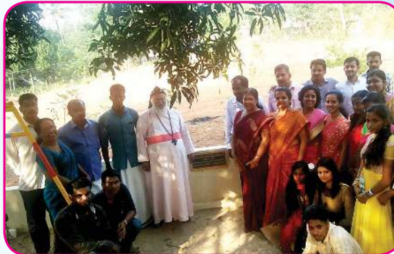
Inauguration of Social Extension Activity - Malayil School by Dept. of Economics