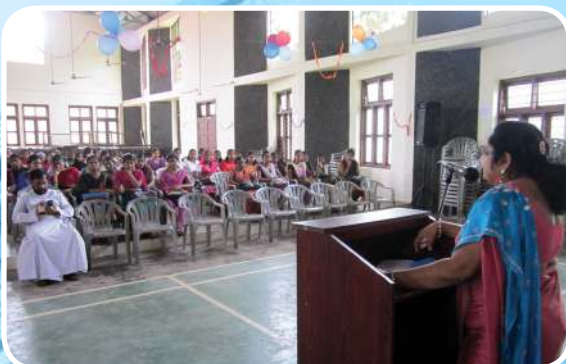
Department of English