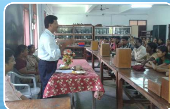
Department of Botany