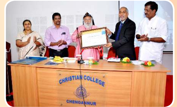
Inauguration of UNAI - ASPIRE Christian College Chapter