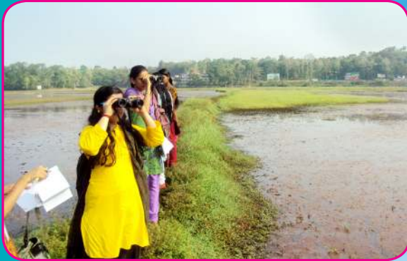
Breakfast with birds on a wetland-Bird Watching Programme.