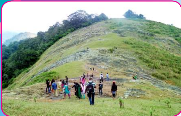
Nature camp at Nelliampathy