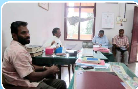
Department of History