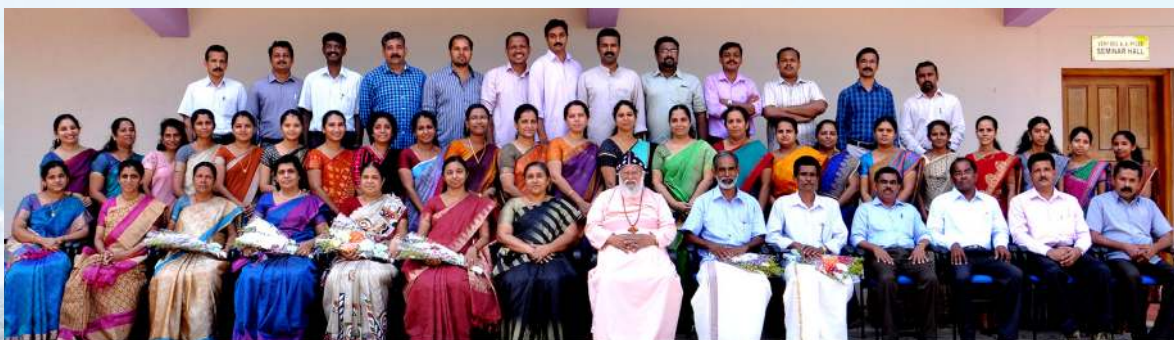
TEACHING STAFF WITH MANAGER