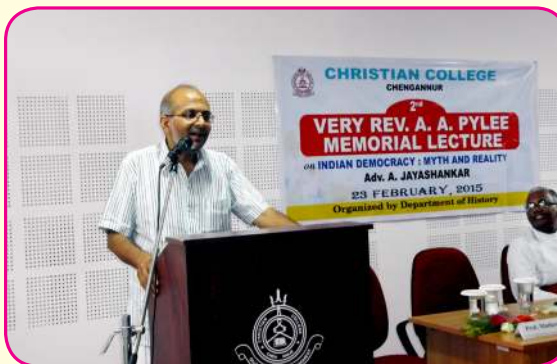
Science Club Students – Experiencing The Reality