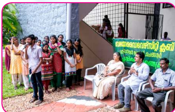
Bio diversity 4