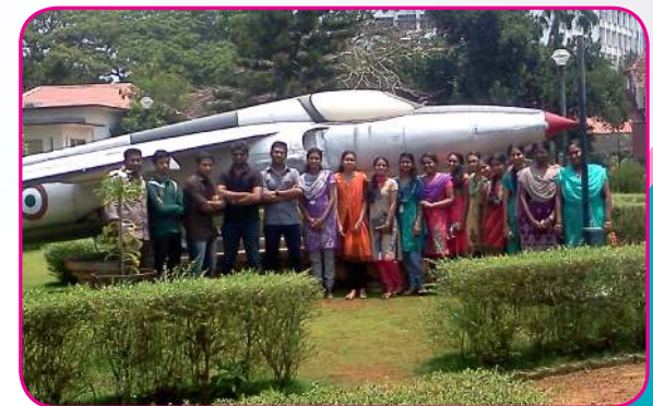
Science Club Students-Visit To Vssc Trivandrum