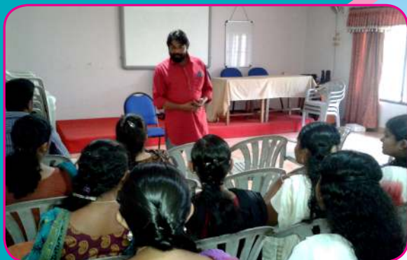
Best Arts 1