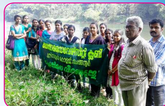
Bio diversity 5