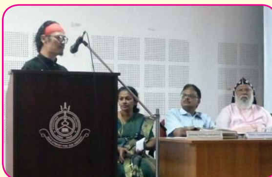
Science Club Students – Experiencing The Reality