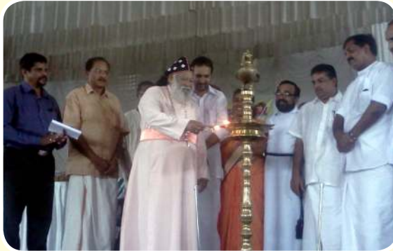
Inauguration of B.Com. & Research Centre In Physics