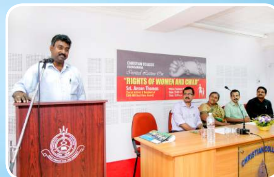
Department of Politics