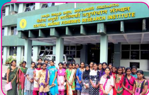
III B.Sc. Zoology Study tour – Visit to CMFRI, Kochi Nature Education camp at Pathiramanal Island