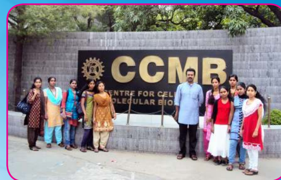
II M.Sc. Zoology Study tour – Visit to Centre for Cellular and Molecular Biology, Hyderabad