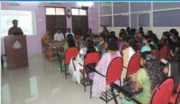
Women Entrepreneurship Development Class by Economics Department and JCI, Adoor