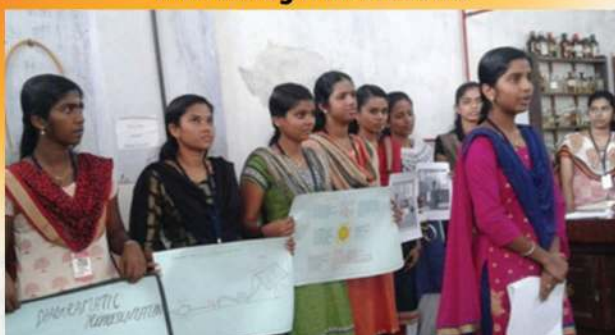
Project presentation and demonstration competition