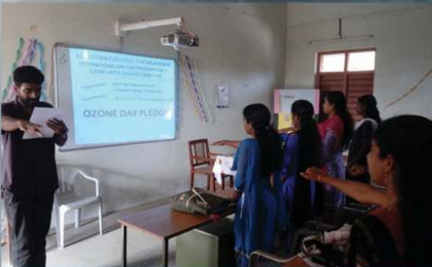
Ozone day pledge taken by the clubmembers on international ozone day