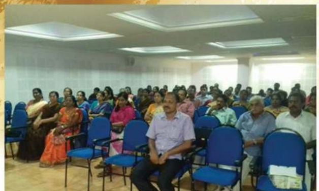
Annual PTA General body meeting