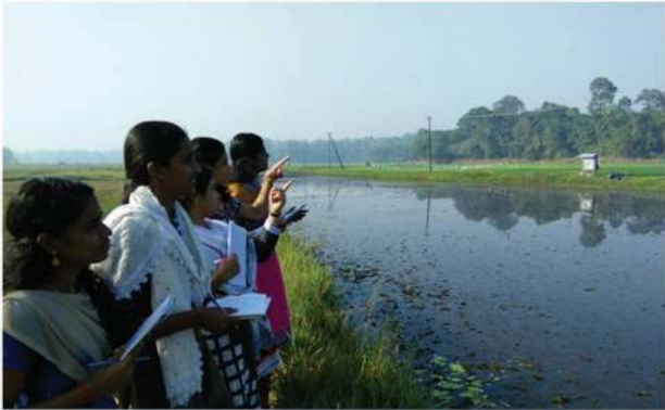
Breakfast with birds:- Bird watching programme