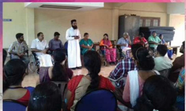
Celebrating Christmas with paraplegic