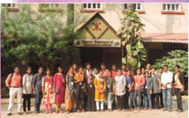
Mentees at Xavier Institute of Communication, Mumbai