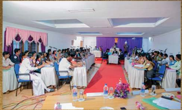
13 th youth parliament competitions