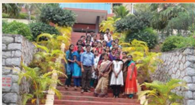
CTCRI visit by PG Chemistry students