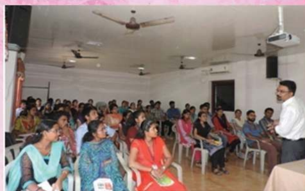
Corporate Placement Training for final year students