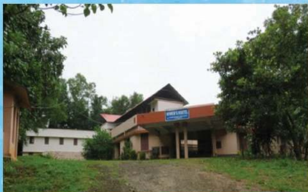
Hostels for Girls and Boys