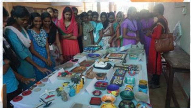
Exhibition of products made from Aquatic weeds.