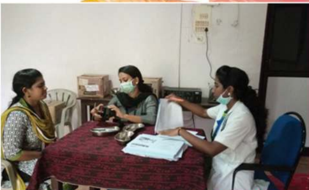
Dental camp for students in association with Pushpagiri College of Dental sciences