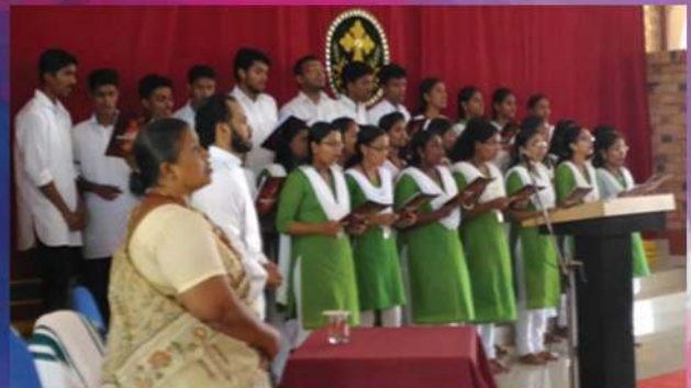
Christmas Carol Service