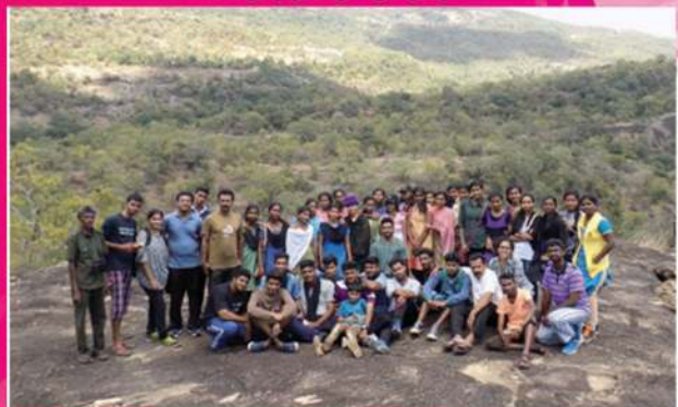
Nature camp at Chinnar Wildlife sanctuary