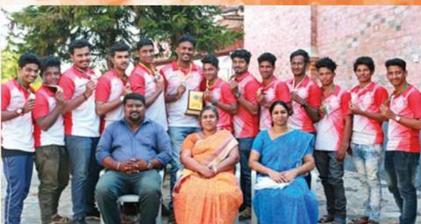
Runners up of the Kerala University Wrestling Championship