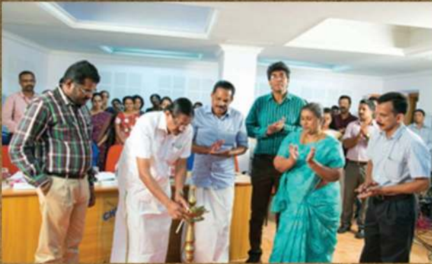
13 th youth parliament competitions inaugurated by Adv. P.C. Thomas (Ex. MP)