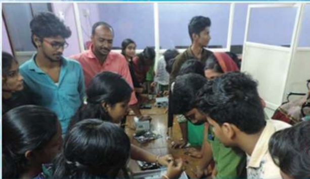
Add on course on computer hardware assembling