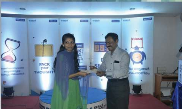
Mathrubhumi Spark Programme Christian College Fellowship