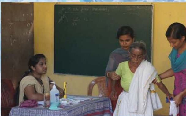
Free Medical Camp in association with Sanjeevani Hospital Kollakadavu, Chengannur.