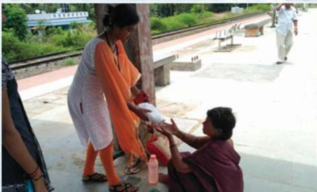
'Pothichor' programme of NSS Units