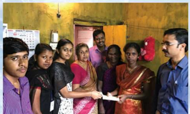
Medical aid to Pavizham mol