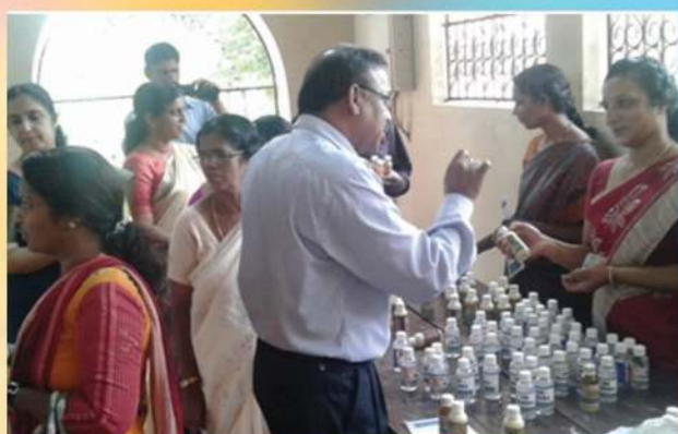
Exhibition and sale of Bio pesticides to the public