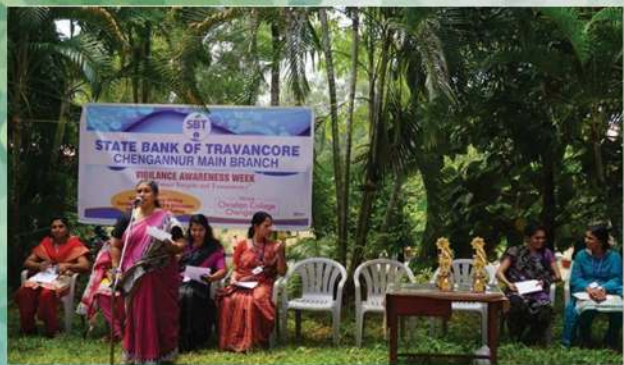
Vigilance awareness week Tourism Club