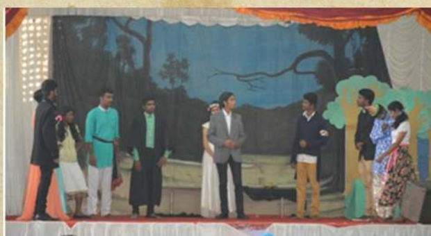
Staging of play As you Like it , REBARD 2016- Festival commemorating 400 years of Shakespeare.