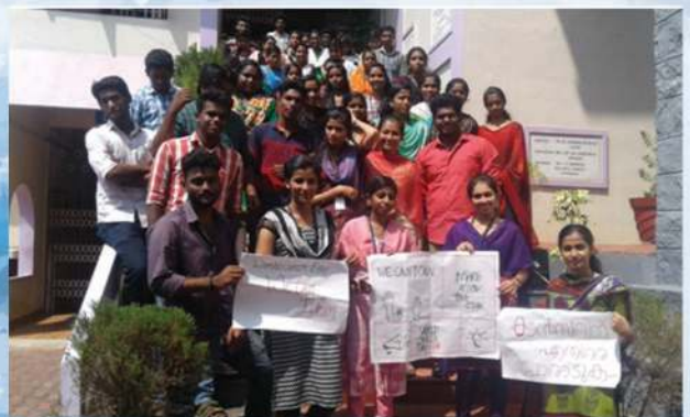
Cancer Awareness Week