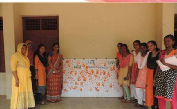
The UN Orange Campaign in Christian College