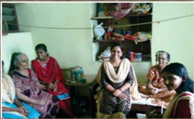
Social Internship programme, Students at St. Andrews Pain & Palliative centre