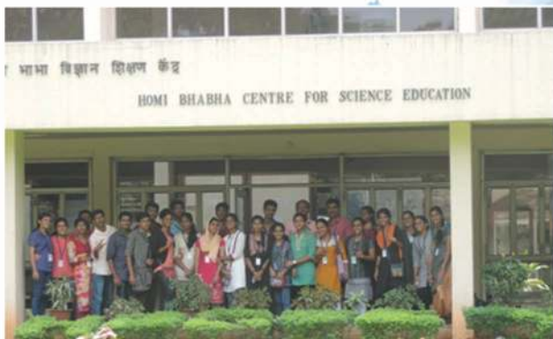
Mentees at HomiBhabha Centre for Science Education, Mumbai