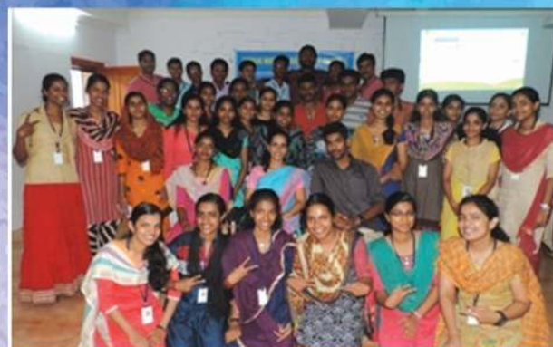
Advertisement Competition CONJURE Up 2K17 Winners with Mentees