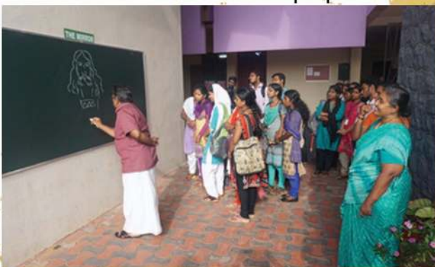
"THE MIRROR", (a canvass to express student's ruminations & reflections), was inaugurated by Artist Ashokan