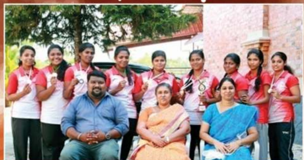
Kerala University Wrestling Championship