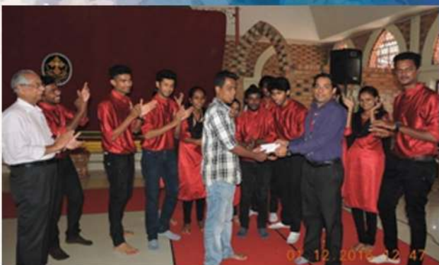
Intercollegiate Carol competition winners