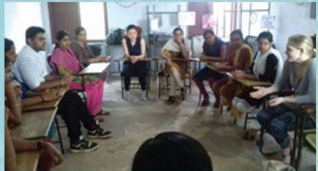
Visit by Students from Germany to the college as part of Students Exchange Programme organized by SCM- Germany