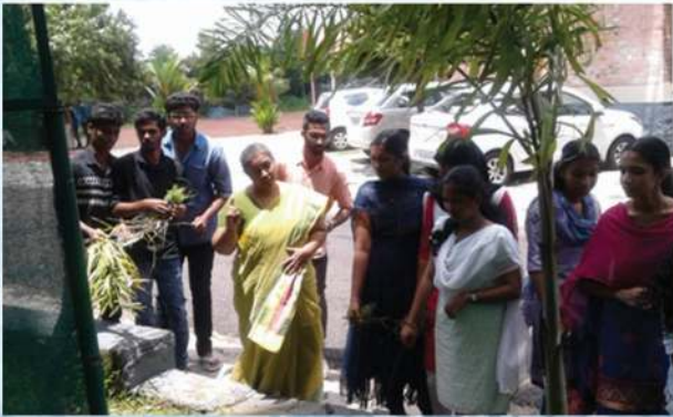
Clean Campus, Green Campus Programme