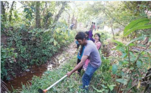
Regular Activities of NSS.