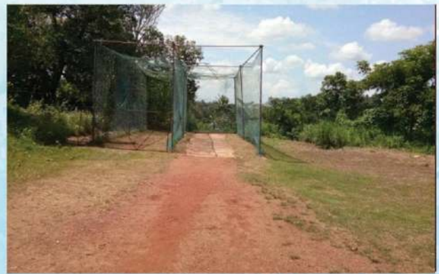
Cricket Practicing Nets