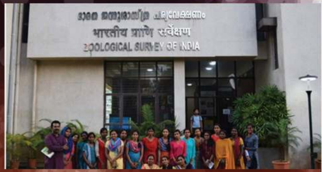
Study tour to Zoological Survey of India