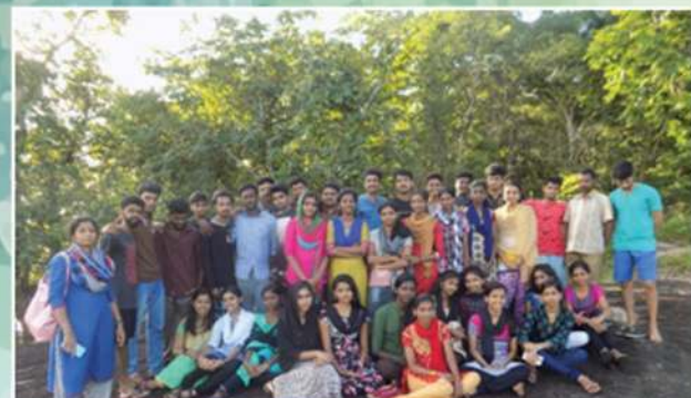
Nature Study camp at Peppara Wild Life Sanctuary ,TVM