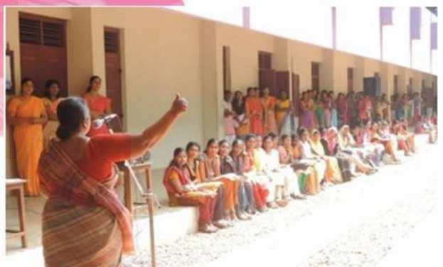
Celebrating UN Day for Prevention of Crime Against Women