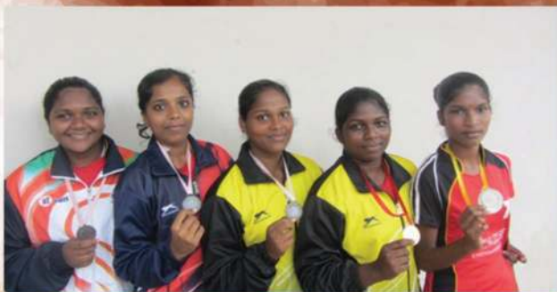
Runners up of the Kerala University Judo Championship.