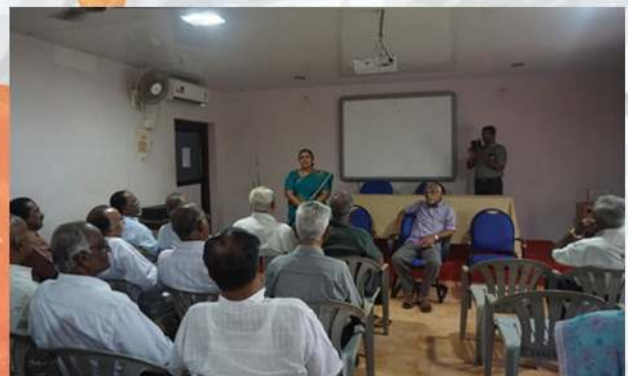
Get together of Retired teachers