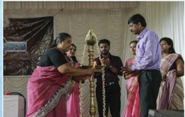
Inauguration of "QUIZARD 2k16"