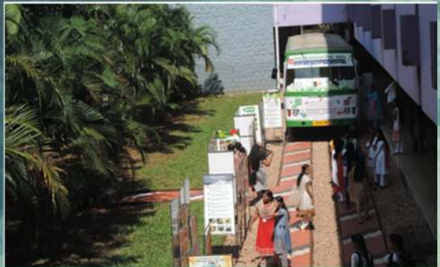
Biodiversity Ratham Visiting Christian College