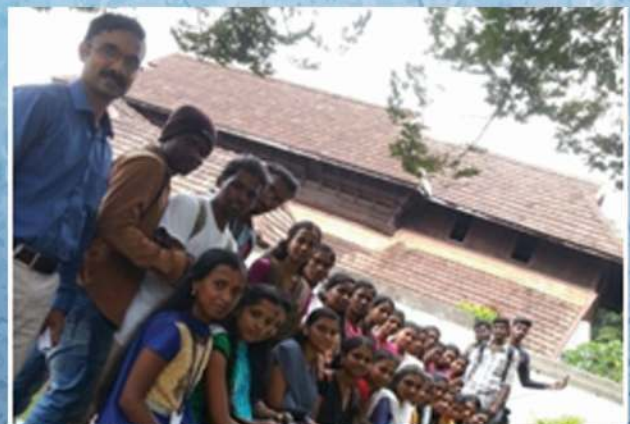
Field Visit at Krishnapuram Palace Kayamkulam