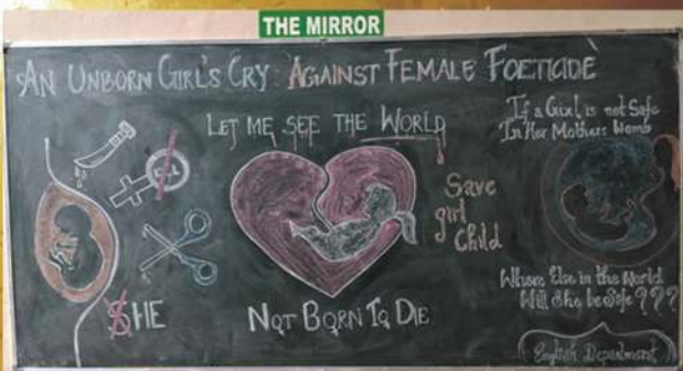
II prize winning drawings on MIRROR by English Department