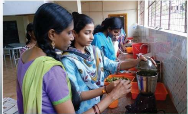
Workshop on the preparation of value added products from water hyacinth