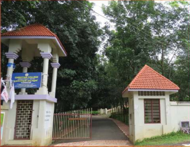
College Main Entrance