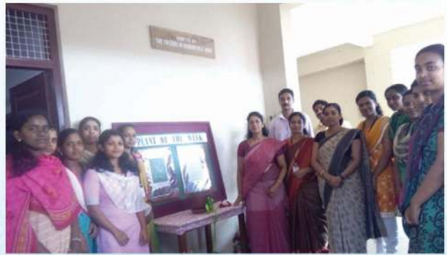
"Plant of the Week" Programme