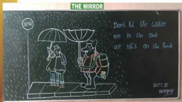
I prize winning drawings on MIRROR by Botany Department