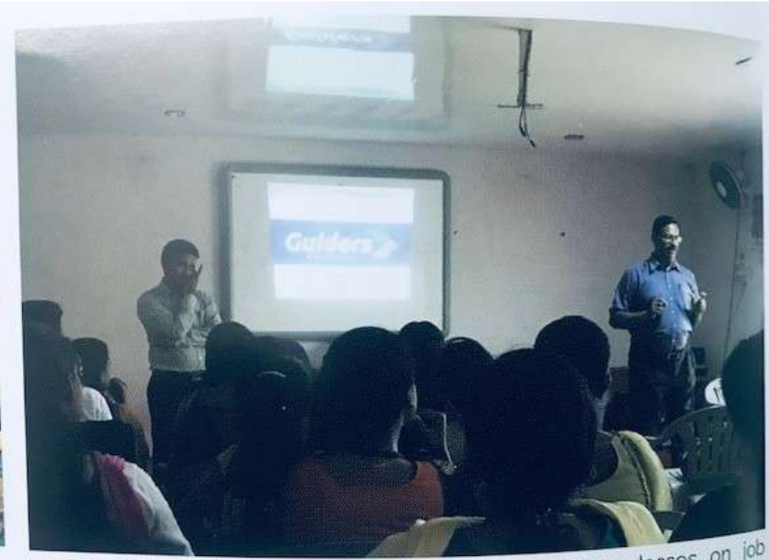
Guiders International conducting career guidance classes on job opportunities in the field of Aviation and Tourism